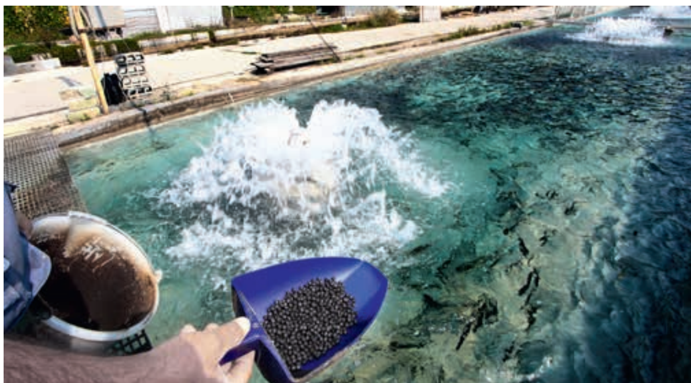
Fish farm at Bussi, in Abruzzo, Italy.

Aquaculture is facing a new era of expansion in Europe. What are the environmental implications of this, and how can the sector expand sustainably? This Future Brief from Science for Environment Policy presents an overview of research into aquaculture's impacts, and considers how it could develop in harmony with environmental goals.